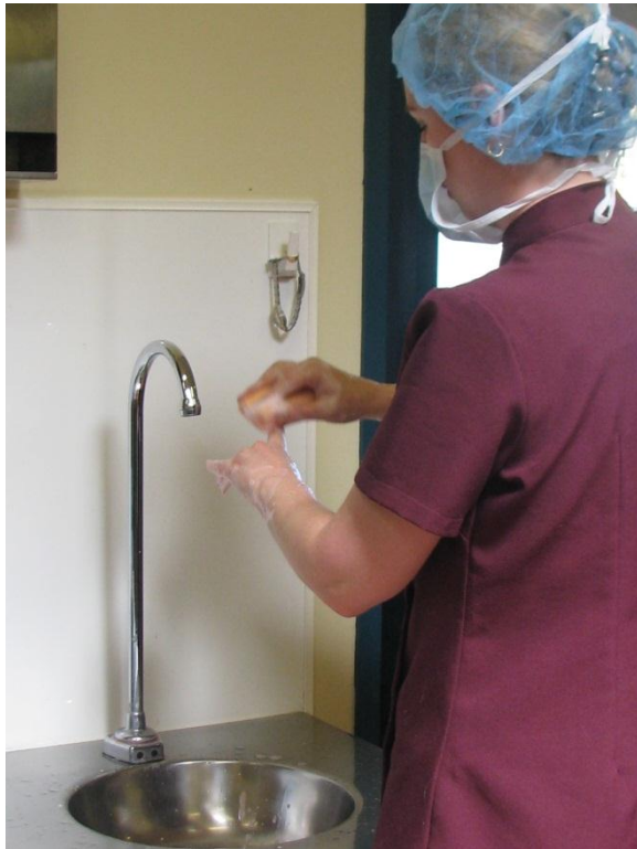
Vet scrubbing for surgery

Surgery is carried out in aseptic conditions with your vet scrubbing their hands with chlorhexidine soap and wearing a hat/mask and sterile gloves during the procedure.