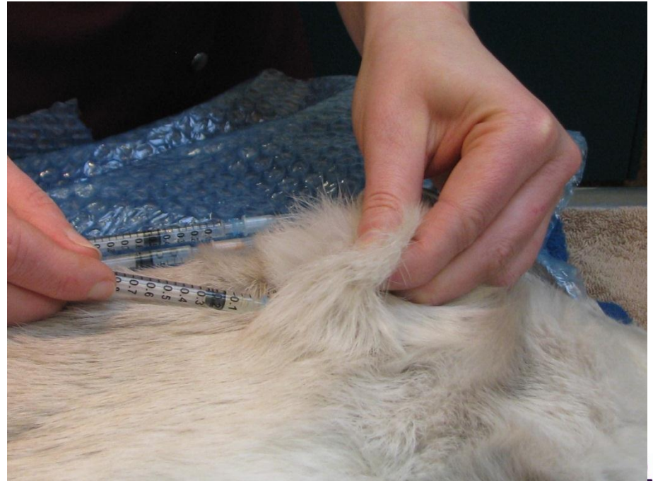
Injections are given after surgery to aid recovery