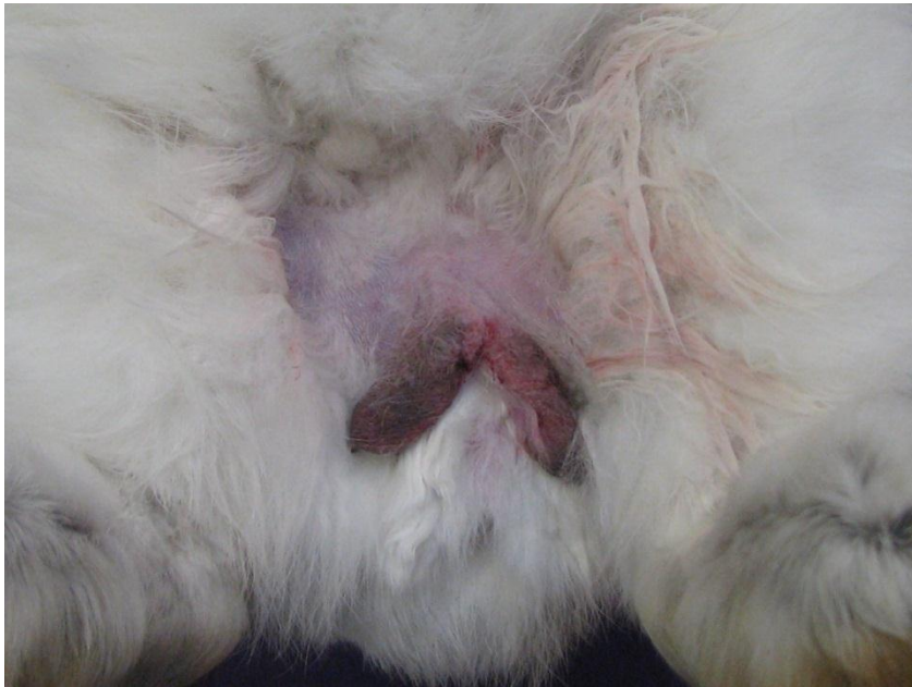
How the scrotum appears immediately after castration