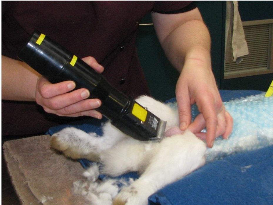
Vet clipping the skin on his scrotum for surgery

Once your pet has reached a stable level of anaesthesia after the injection, they are then prepared for surgery – the skin over the scrotum will be clipped (shaved) and it is cleaned with chlorhexidine and to ensure sterility.