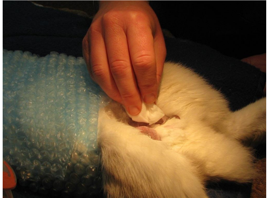
Scrubbing the skin prior to surgery