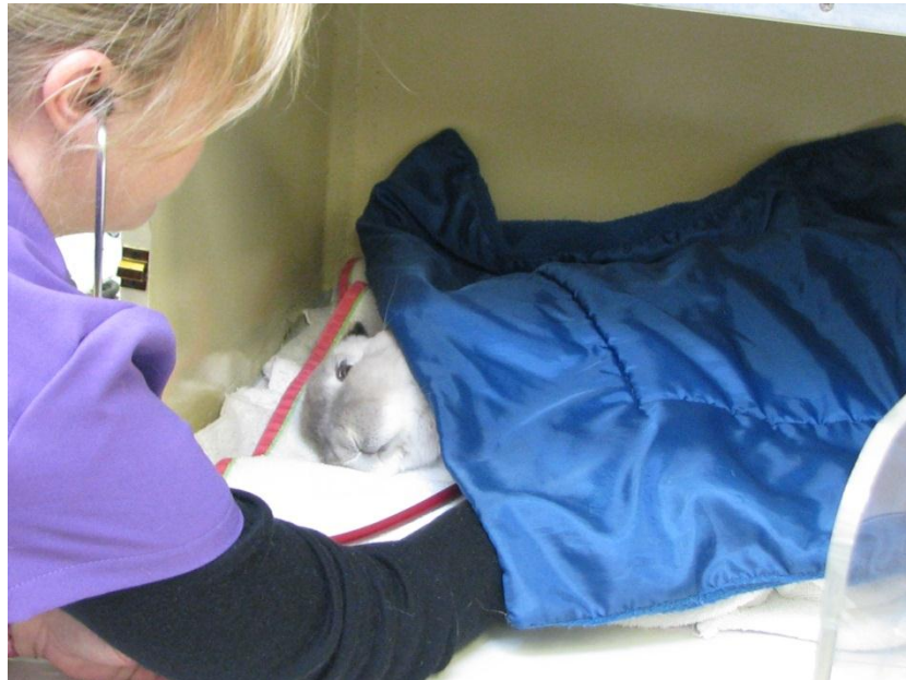
Nurse monitoring recovery

As it is important for rabbits to start eating as soon as possible following an anaesthetic (to aid gut movements) we feed them small amounts of pureed apple via a syringe as soon as they are awake enough to swallow. Once they are up and about, they are offered the food you brought from home.