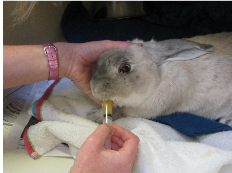
Encouraging the bunny to eat to aid gut motility