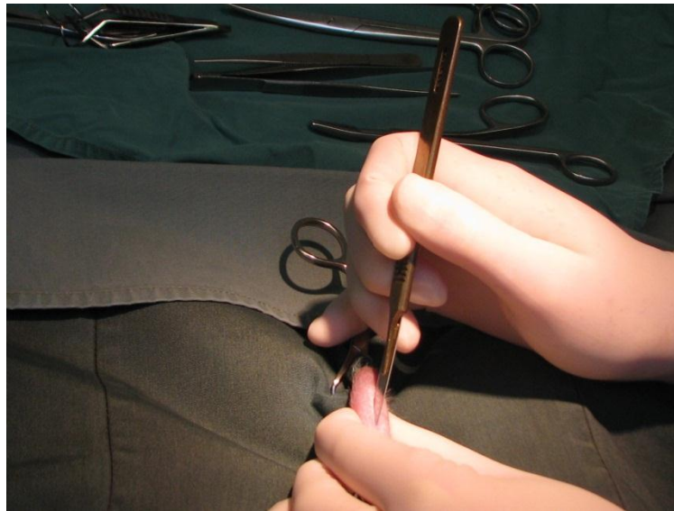
Making an incision in the skin over the testicle

Your rabbit's scrotum is covered with a sterile surgical drape and a sterile surgical kit is opened especially for their surgery.